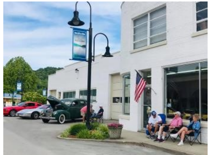
July 12th, Beattyville Main Street!