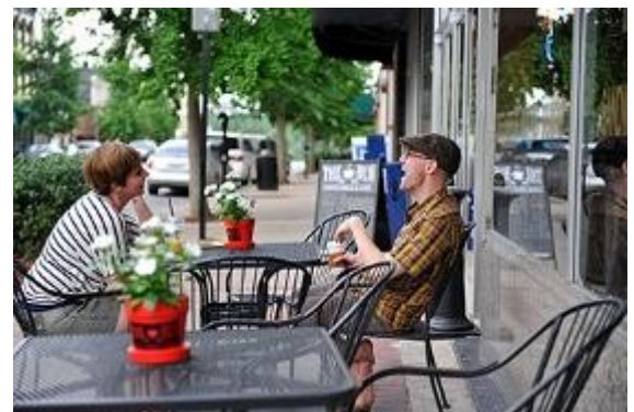
Enjoying the day in downtown Danville!

Bardstown Main Street is a pet friendly town and we encourage you to take a walk downtown with your pet. Not only do they have water outside the visitor center but you can also use their pet bag containers found downtown if you need to clean up after your pet!