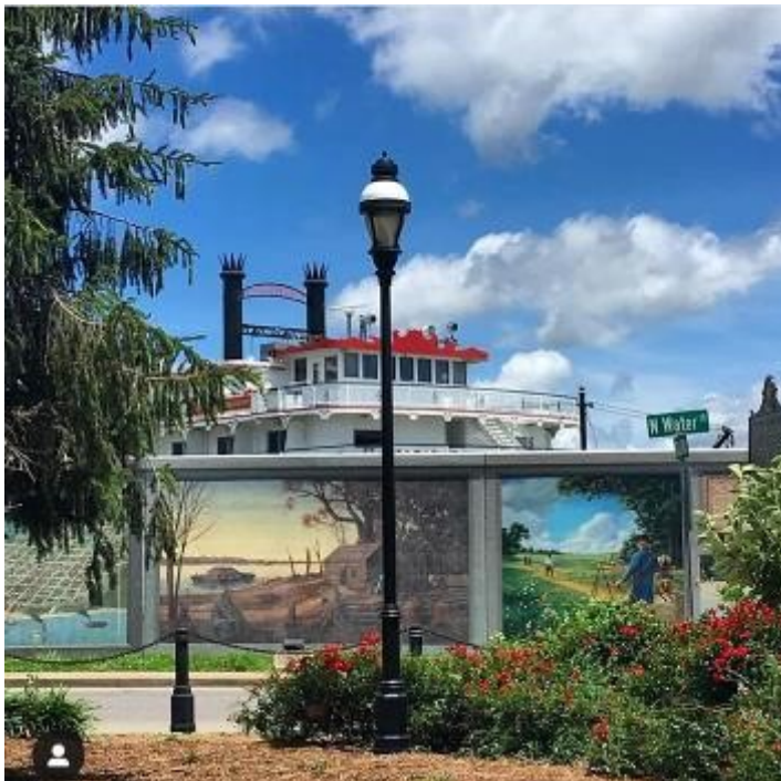
A beautiful photo of downtown Paducah.

Starting with wafers, cut or break as necessary to fit into jar, create layers. Alternate between the wafers, the pudding, the sliced bananas, and the whipped cream until jars are full. Finish with a spot of whipped cream and a banana slice tucked into the top. Garnish with fresh mint if desired.